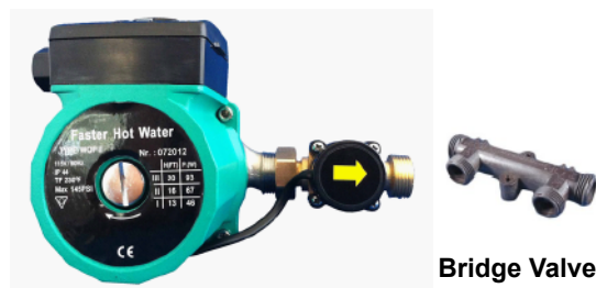
WaterQuick Standard - with built-in Flow Monitor